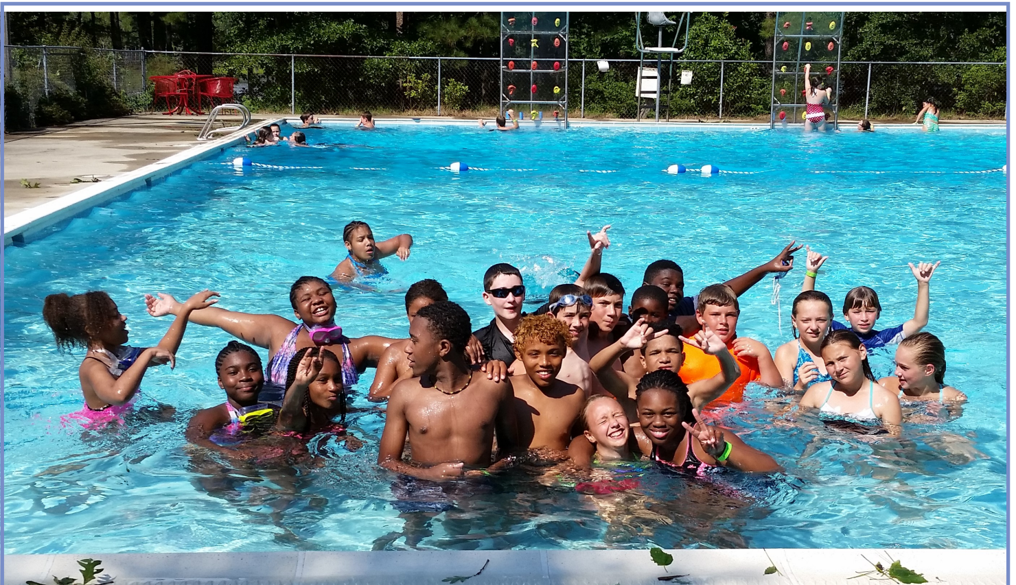
Boys & Girls Club at Camp Silverbeach

These examples do not include the Donor Allocations. Donors have directly supported nonprofits such as Riverside Hospice , the local Volunteer Fire Departments , The SPCA , Barrier Islands Center , Little League and many health and service organizations on the Shore.